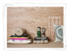
Devilish Design Deals