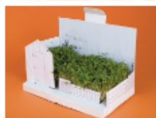
Postcarden Living Garden Cards