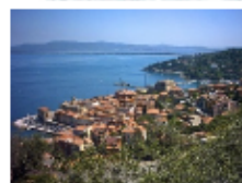
DailyCandy Guide to Maremma, Italy