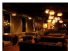
The New Trousdale Lounge Opens